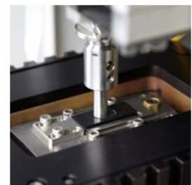
*Vibration wear test against 100 Cr6 steel