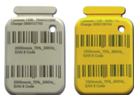
Examples for laser markable LUVOCOM