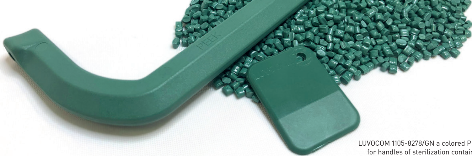
LUVOCOM 1105-8278/GN a colored PEEK for handles of sterilization containers